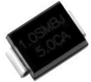
Package: DO-214AA / SMB